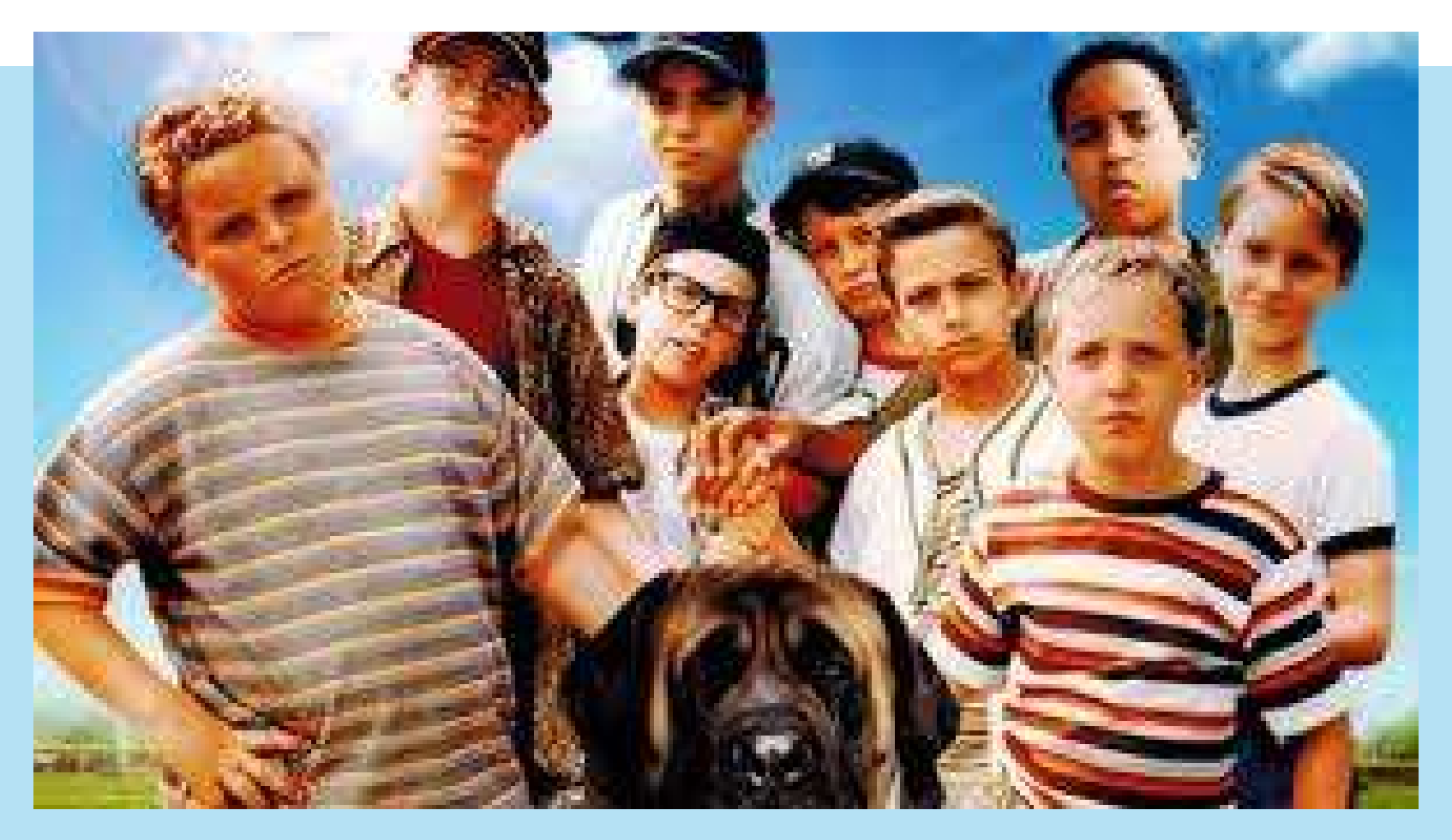
It's a team thing!