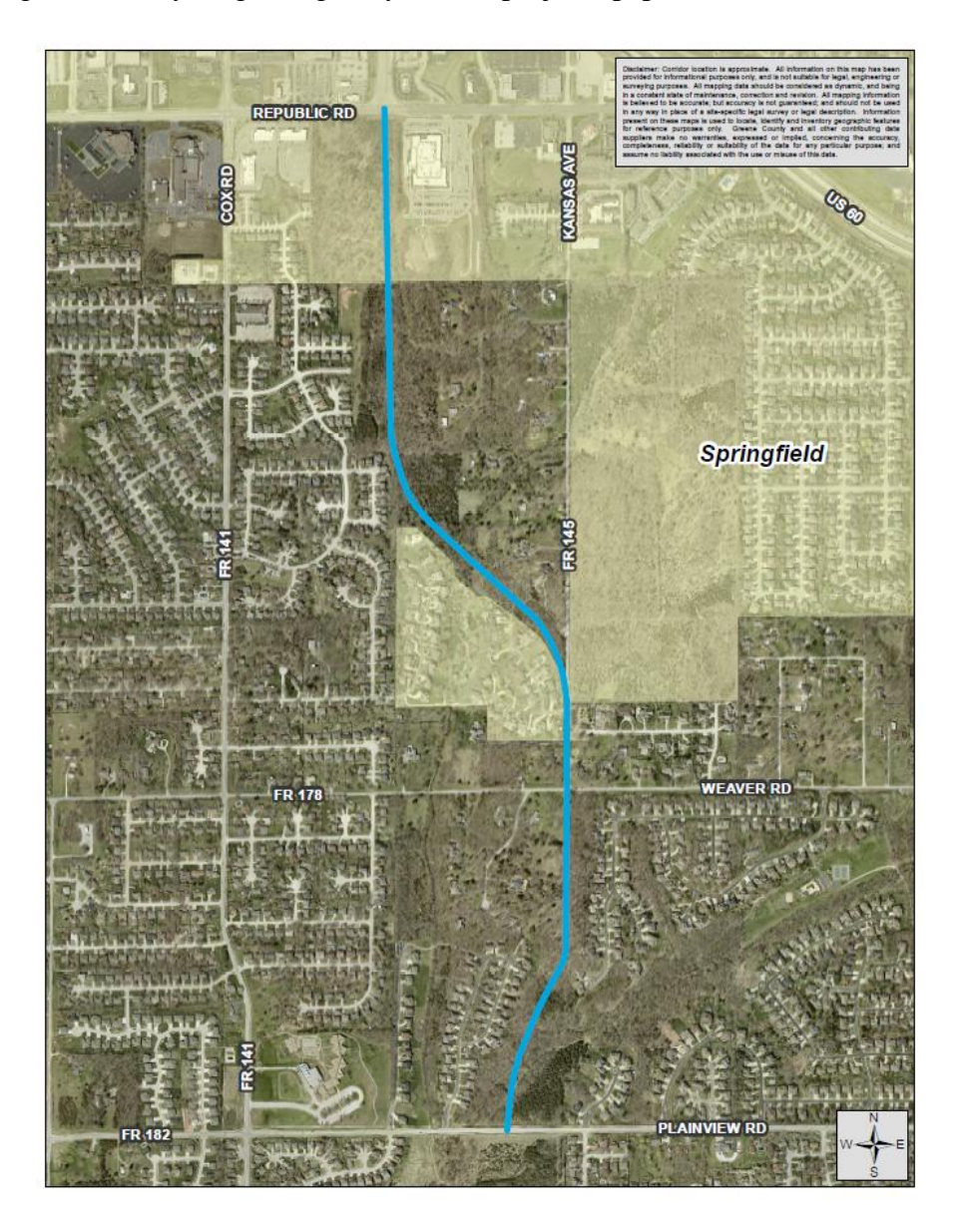
Kansas Expressway Extension Phase 1 construction route

For more information on the extension plus project materials, please visit: https://www.greenecountymo.gov/highway/future_projects.php.