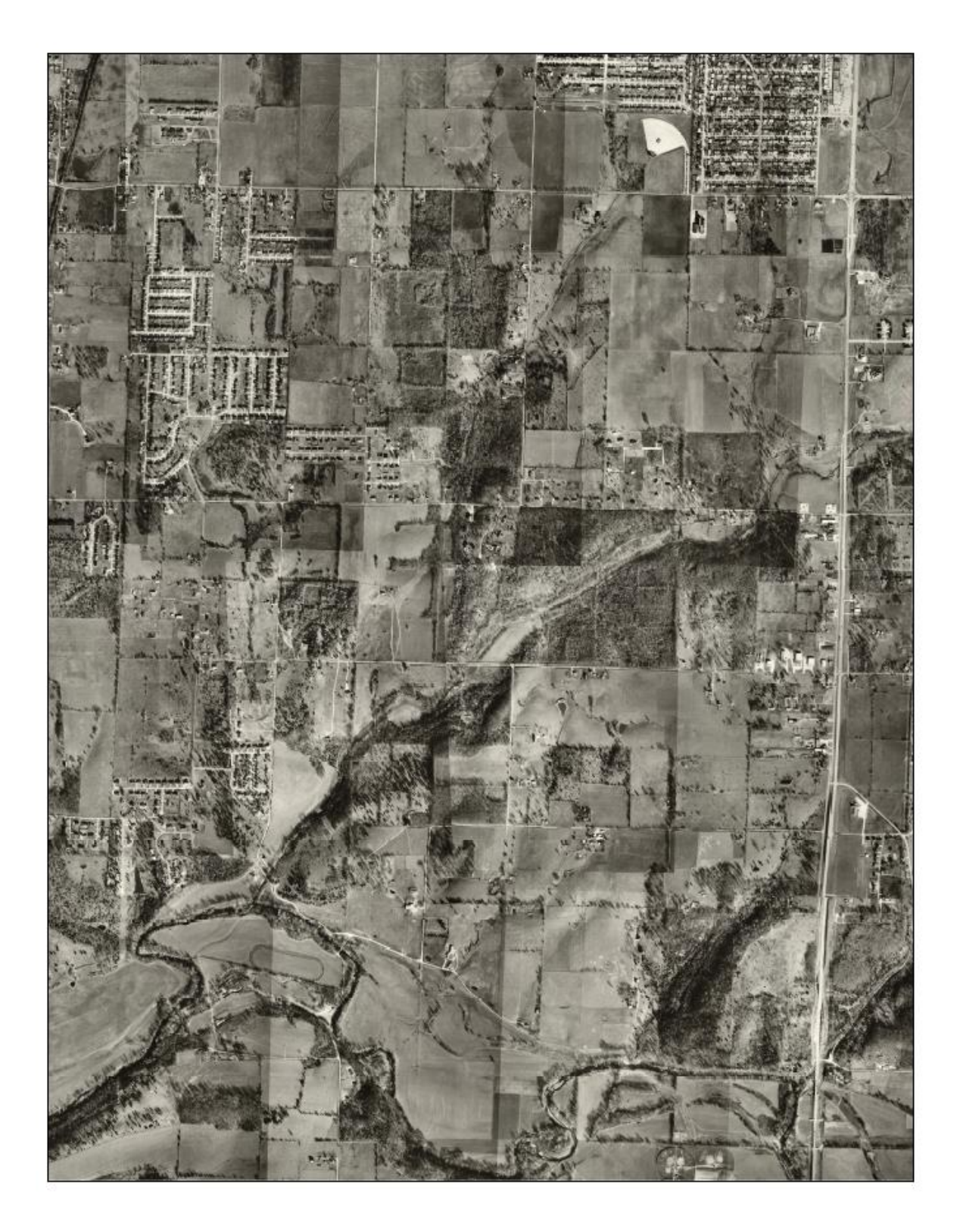
1980 aerial photo for the Kansas Expressway Extension study