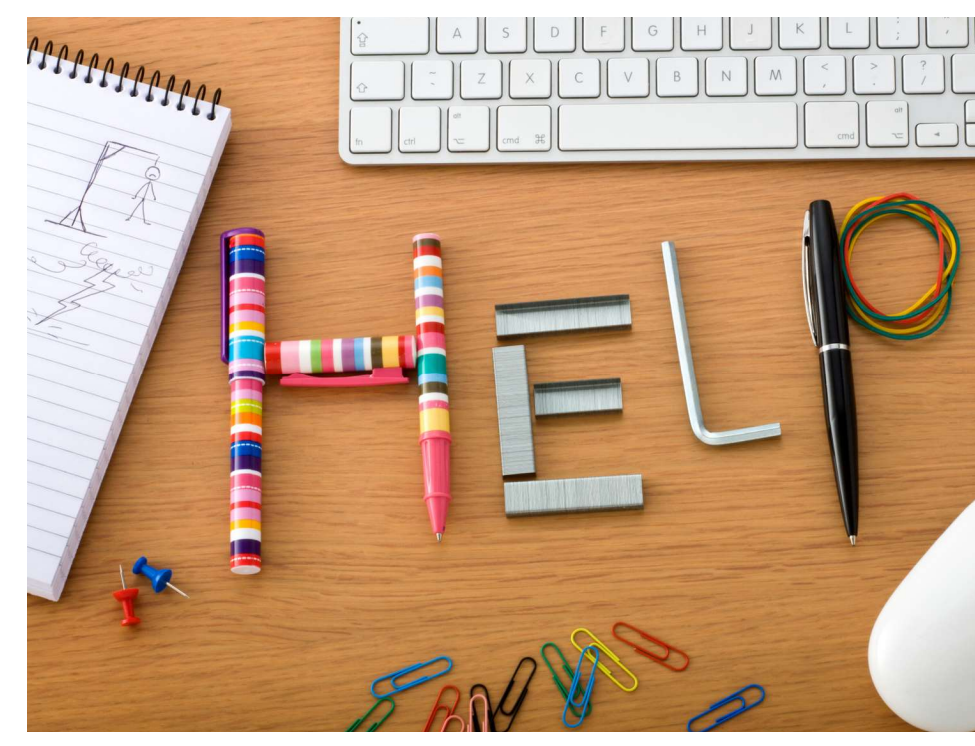
An employee assistance program can be a lifeline during turbulent times.