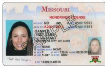
Missouri Non-Driver License