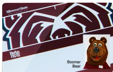
ID from a Missouri University, Community, Vocational or Technical College